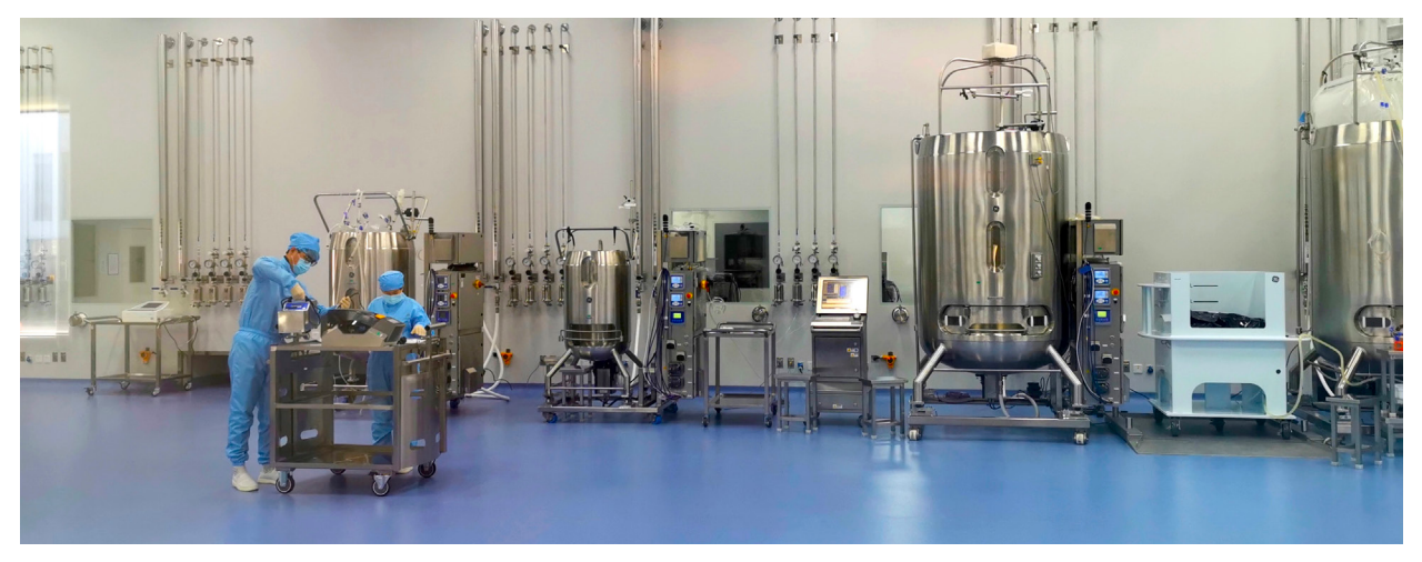
CEPI partner Clover Biopharmaceuticals began Phase 1 trials in June.

In April, US$10 million was disbursed to CEPI for vaccine development.