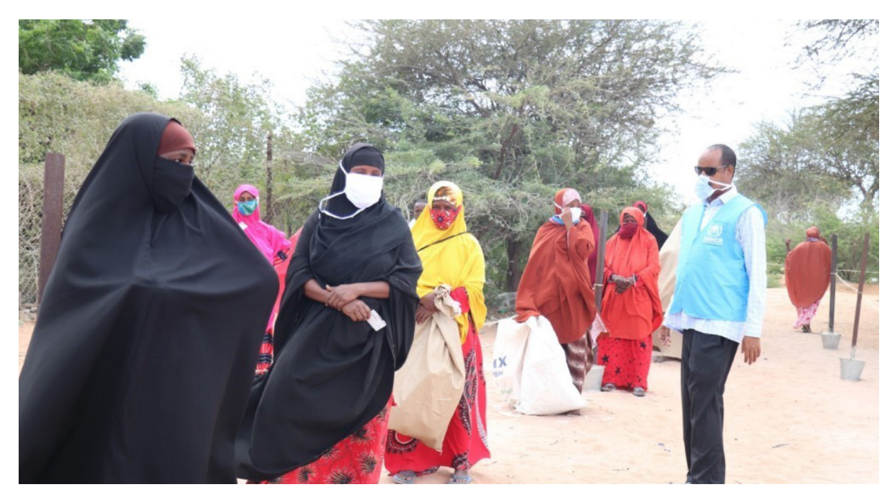
Women at the Dadaab refugee camp in north-eastern Kenya line up to receive supplies from UNHCR.

UNHCR's response and interventions in Kenya, Uganda, South Sudan, and Lebanon offer a snapshot of how Fund contributions are being used to provide immediate support in emergency humanitarian field operations. UNHCR is also continuing to respond to long-term protection needs in these countries.