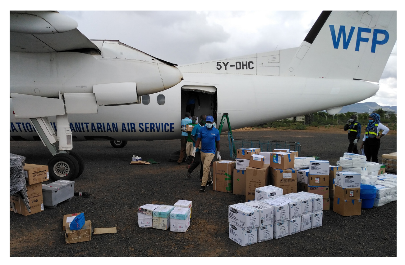
A consignment of PPE arrives in Kakuma, Kenya via the WFP-managed United Nations Humanitarian Air Service.

WHO Strategy Pillar 1: To ensure global and regional coordination of response efforts, including coordinated global supply chain management.